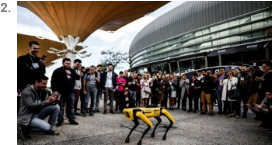
Princeton Students' Viral Robot Dance with Boston Dynamics Sparks Debate on Robotics in Entertainment, Education