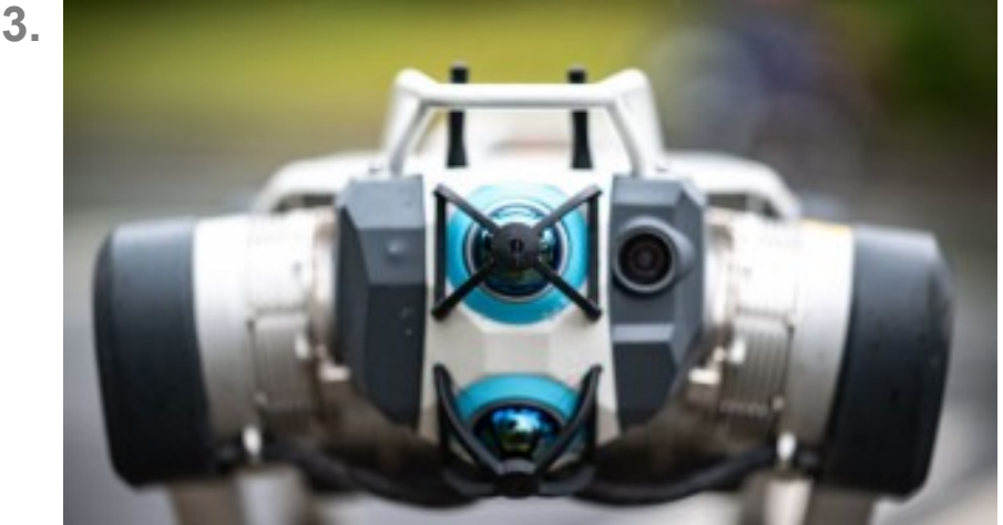
China Shows Off Gun-Toting Robot Dog in Military Drills, Sparks Global Concerns