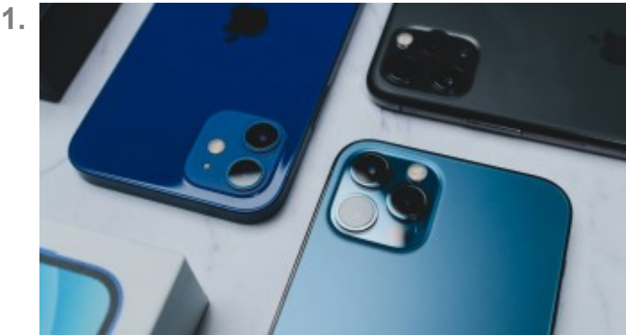
Apple Unveils 'Safety Button' For iPhone Owners to Protect Themselves From Stalkers